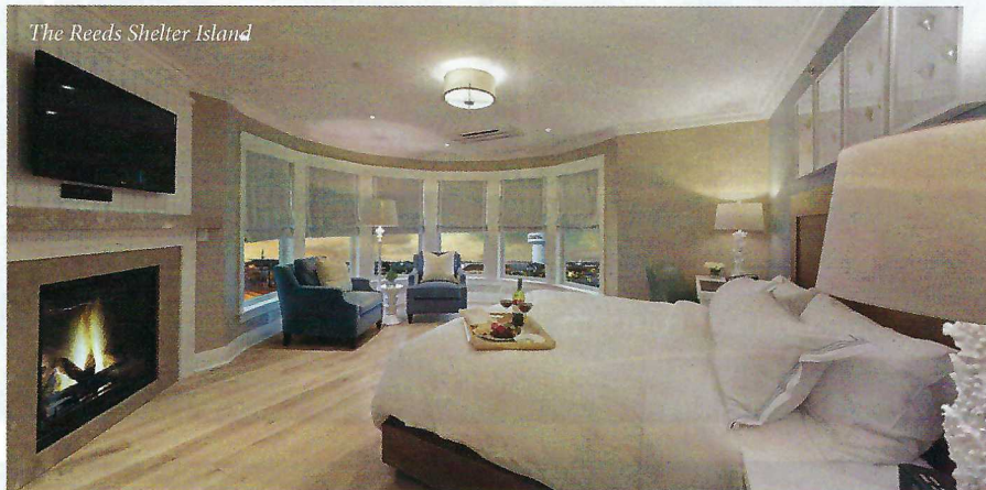
The Reeds Shelter Island