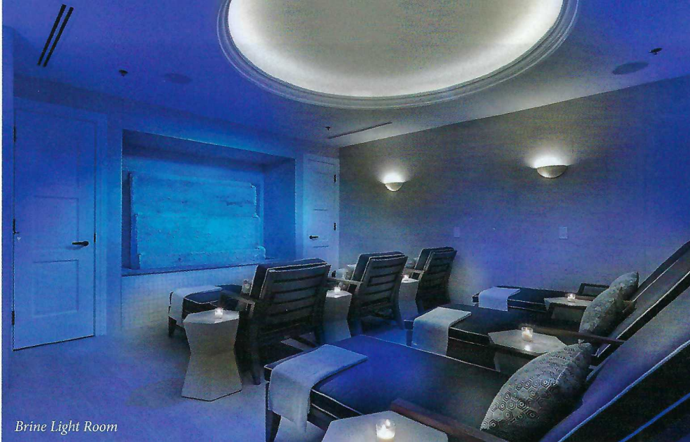
Brine Light Room

The opening of Salt Spa expands on the hotel's existing wellness programming of daily yoga classes, a plunge pool, and two hot tubs on the Roof Garden lounge area during the summer. Also available then are complimentary paddle boarding and kayaking on the bay. Other seasonal offerings include complimentary beach butler service mid-May to early October featuring roundtrip transfers via electric car to the beach. Also included are beach tags, chair, towel, umbrella service, bottled water and ices. The Reeds has partnered with Stone Harbor Golf Club for tee times on the 18-hole course year-round.